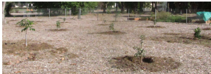
View outside the fenceline, looking in