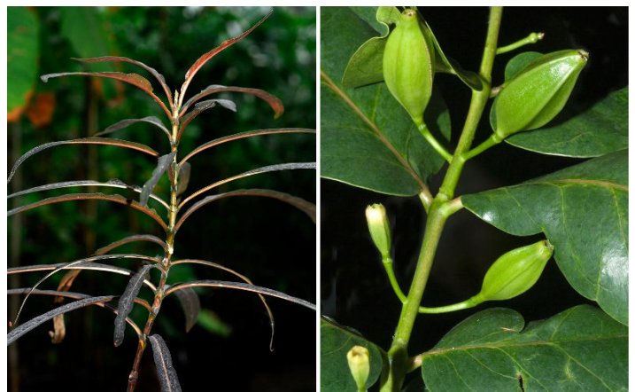
Leaves of immature (left) and mature (right) café marron

However, the story doesn't end here. Something surprising happened as the seedlings continued to grow. The resulting offspring looked nothing like the adult plant. Where the adult plant has round, green leaves, the juveniles were brownish and lance shaped. This was a puzzle but not entirely surprising because the immature stage of this shrub was not known to science. Amazingly, as the plants matured they eventually morphed into the adult form. The question remained, why go through such drastically different life stages?