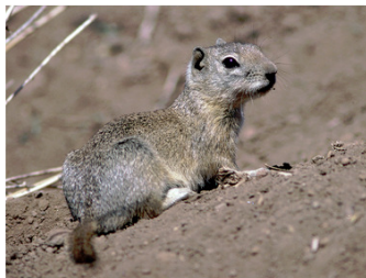
Belding's ground squirrel

They are also disease vectors, which is not as big an issue in urban areas, but becomes a major problem near forests and wild areas where they can spread plague and other diseases. Fortunately, there is no rabies in California squirrels. (Some bats do carry rabies, but squirrels, skunks, and raccoons do not - the bigger concern is distemper.)