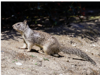
California ground squirrel

Two ground squirrel species in California cause the most damage: the California ground squirrel and Belding's ground squirrel. Not only do they eat crops, girdle trees, and mangle irrigation lines, but their burrows can cause soil erosion, water issues, and can be a major tripping hazard.