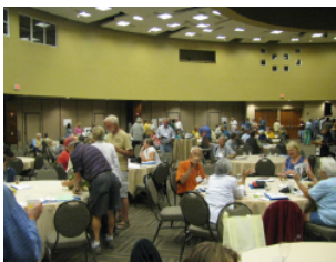
Friday Night Reception