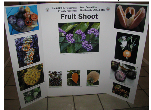
Fruit Shoot Winners

As for the raffle, there were so many prizes that almost everyone that bought a ticket walked away a winner.