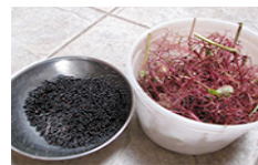
Stems and Berries

It takes a long time to pull off ALL the stems! No red or green berries allowed, either. Soak in water so any remaining stems float to the top and can be removed.